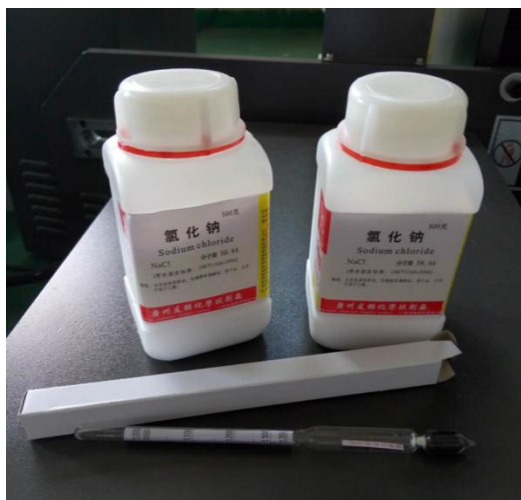
Sodium chloride (testing salt)